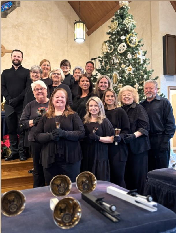
The Lake Forest Handbell Choir provided special music in our 10:45 a.m. worship service on December 17.