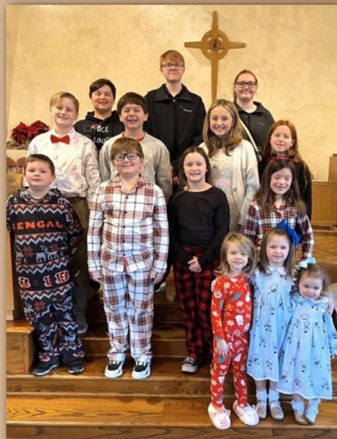
Our children, decked out in their Christmas pajamas, joined our chancel choir for our Lessons & Carols Service during our 10:45 a.m. worship service on Sunday, December 24.