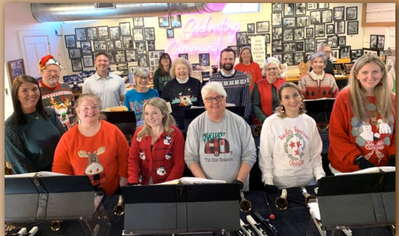
Our Handbell Choir also delighted our community with the sounds of Christmas at the farmSouth store on December 23.