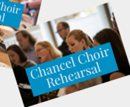
Chancel Choir Rehearsal