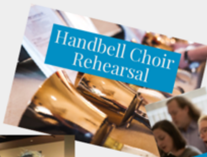
Handbell Choir Rehearsal