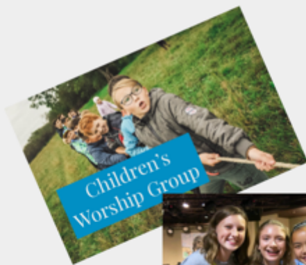
Children's Worship Group

All our Wednesday Night Activities Resume Beginning September 7