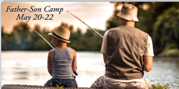
Father-Son Camp May 20-22

Sign-ups have begun. You can sign up to attend our annual Father-Son Camp in the narthex and if you have any questions about this year's event talk with