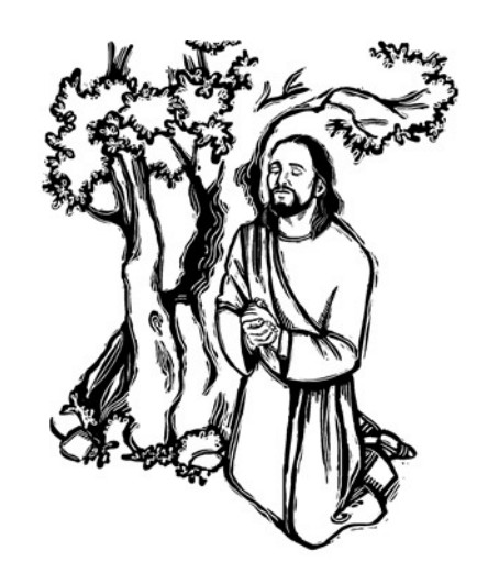
Copyright © Sermons4Kids, Inc. May be reproduced for Ministry Use