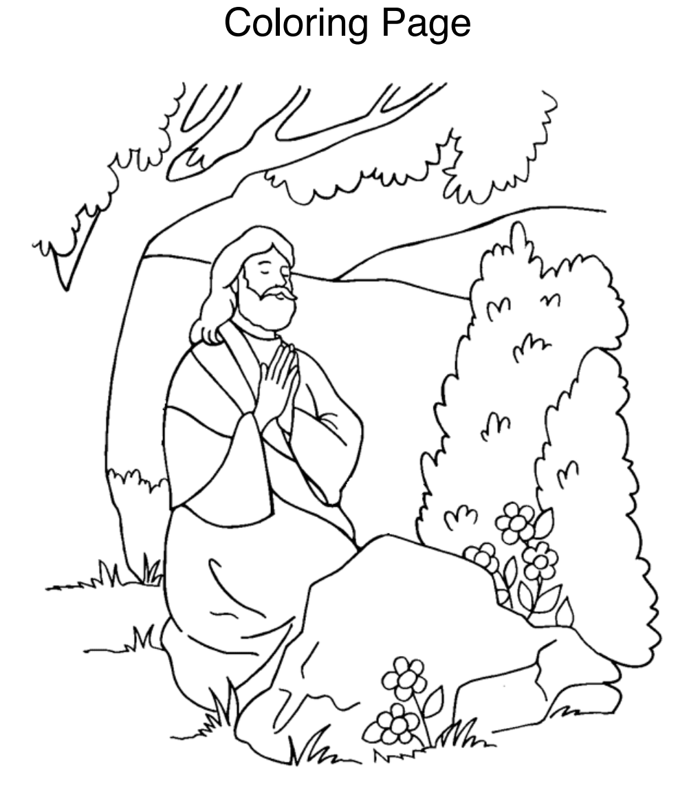
Jesus Prays for His Disciples